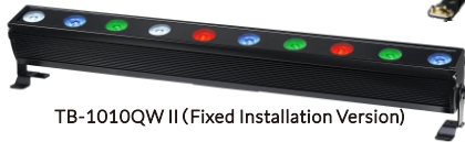
TB-1010QW II (Fixed Installation Version)