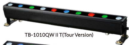
TB-1010QW II T (Tour Version)