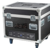
LED-EX100Z Chargeable Flight Case(Optional)

Motorized linear zoom system Zoom range:10°~60° Outstanding color macro effect 0~100% smooth dimming Variable strobe speeds Manual adjustable tilt to 250 degrees